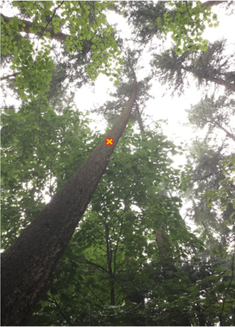
Tree to be removed