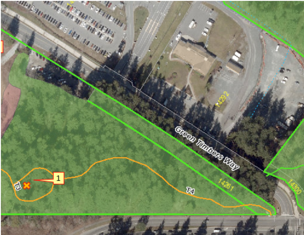
Location of tree

The tree unfortunately has significant internal decay ( Phaeolous schweinitzii – a common fungus found in Douglas-fir trees that causes severe decay of tree roots and buttress) at the base of the tree. The tree has been assessed by staff who are certified tree risk assessors and involved drilling into the tree with a resistograph drill to determine the extent of the decay. The tree meets the City's risk threshold for removal due to the severity of the decay and the risk of failing onto people using the adjacent trails.