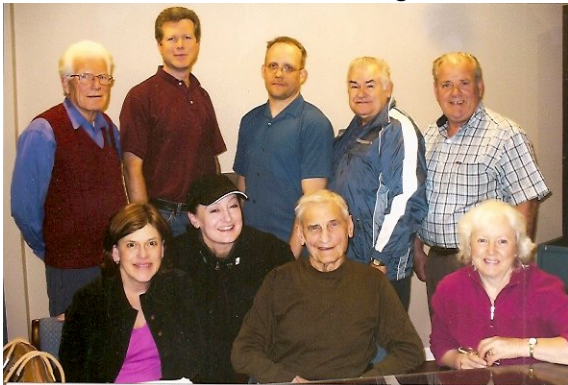
Photo: GTHS Directors in 2008. Join us at 6:30 PM at ABC Restaurant, 15373 Fraser Highway. We'll buy our own meals, hear the 2011 SNAP Projects Reports, elect Directors for 2012, and we'll talk about October 1.