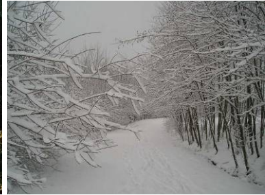
Photos by SHS Members: Evergreen Stand by Robin Hooper, Snow Trail by Pontus Agren. Please send more photos!